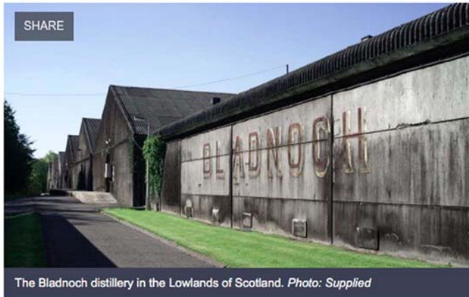
The Bladnoch distillery in the Lowlands of Scotland.