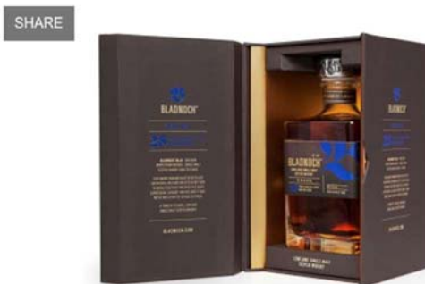
There are extremely limited stocks of the 25-year-old Talia.

Within the walls of the old distillery, the businessman has built a state-of-the-art facility with a 1.5 million litre capacity yielding around three million bottles per annum.