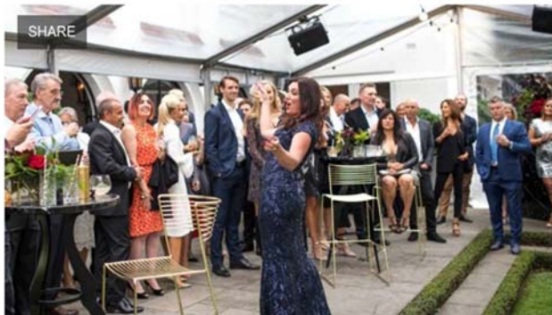
An opera singer launches the three new expressions at Prior's home.

"You can take something old but you can still reinvent it," Prior tells Executive Style after the party. "The look and even the taste of Bladnoch is fresh and new."